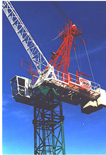
Photograph 1: Luffing jib tower crane similar to that involved in the accident